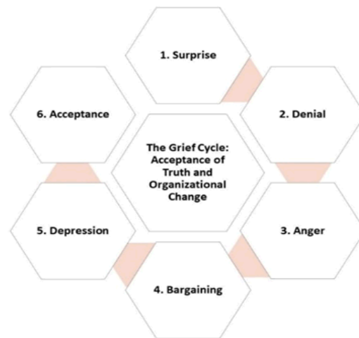
Figure 2. Six phases of grief leading to acceptance of the truth and buy-in to organizational change. Simplified and recreated from Stokke (2014).

lacking deficiencies. However, making a change, whether personal (employee level) or organizational, requires acceptance of a deficiency (e.g., a behavioral or procedural failure). It is only when that truth is accepted that change can occur because complacency is often no longer an issue with acceptance of the truth and commitment to change (buy-in). This is because those who might otherwise be complacent have accepted the truth, bought in, and are engaged in the change. Operationally, a truth-telling and acceptance phase would be navigated before or in concert with step #1 in Figure 1 and would be continued as needed throughout the change initiative. This process is challenging and requires a great deal of strategic thinking and empathy on the part of leadership. Empathy is critical at this stage because accepting the truth(s) that lead to a successful organizational change initiative can be similar to the typical phases of grief. Those phases often include denial, anger, bargaining, depression, and finally acceptance (i.e., buy-in) ((McAlearney et al. 2015; Romadona and Setiawan 2021), and references therein) (Figure 2).