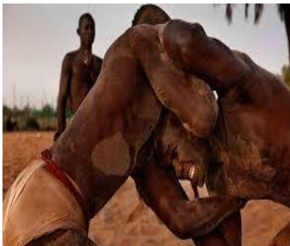
Figure 3 : lutte traditionnelle sénégalaise