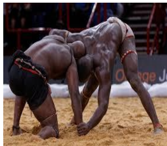
Figure 4 : lutte traditionnelle sénégalaise

To carry out the work, documentary research was used. In addition to scientific texts, the Senegalese Sports Charter No. 84-58 of 23 May 1984 and the general regulations of the National Committee for the Management of Wrestling in Senegal were also consulted (Diouf, 2018).