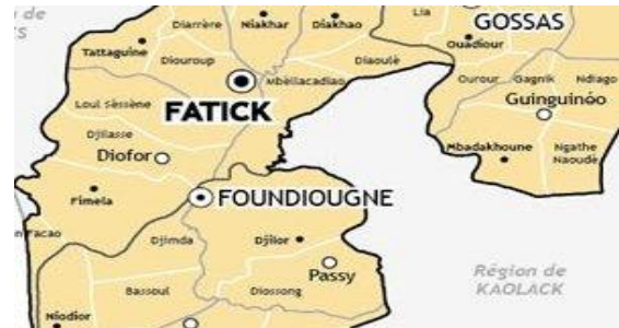
Figure 2 : Carte région Fatick